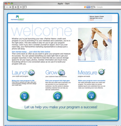
Our comprehensive management website puts the tools you need to stay in control right at your fingertips.